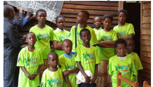
Bulengo (pygmy village), Minova and Nabidio are being paid.

In addition to the 40 children who live in the orphanage in Kikamata, the school fees of 85 other orphans living in Goma,