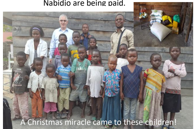
A Christmas miracle came to these children!

Please visit the website for more pictures and videos.